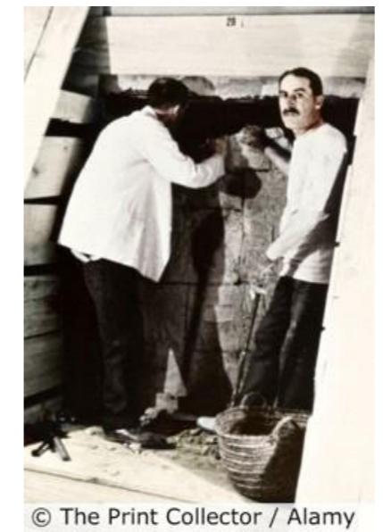
The tomb of Tutankhamun was discovered in 1922 by Howard Carter.