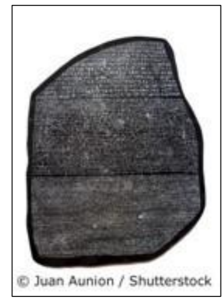
The Rosetta Stone was discovered in 1799.